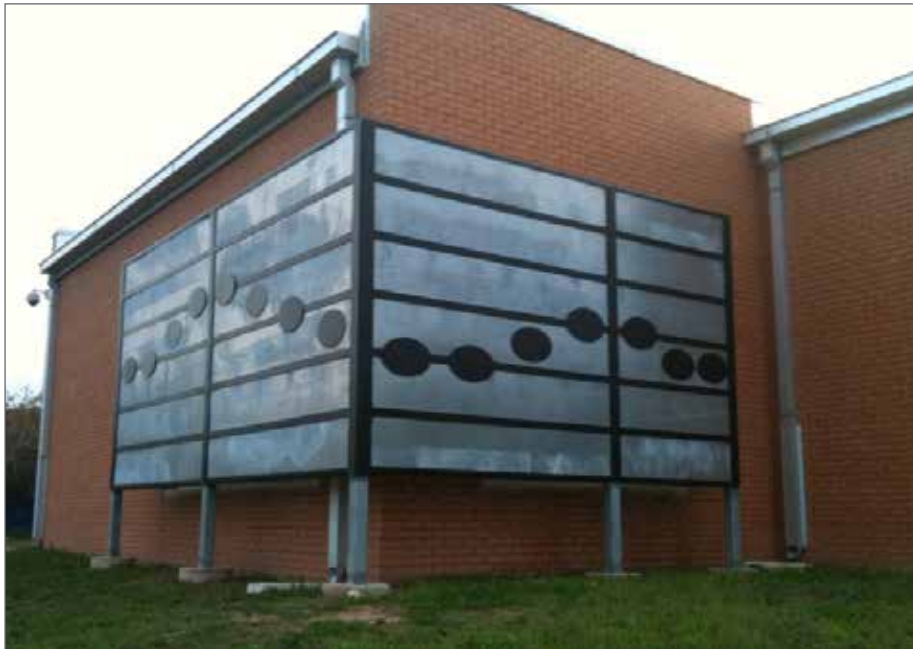
Notable window coverings for the BHE Music Room

As you drive down Barton Hills Drive you may not know that behind the window screen pictured above the Barton Hills Choir is practicing to perform in their FIFTH Austin City Limits Music Festival.